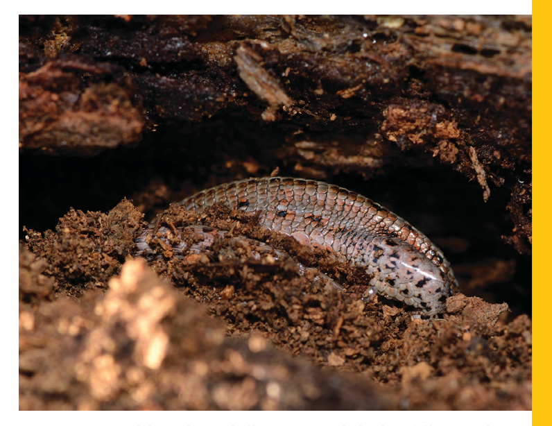
Lizard partially exposed during hibernation

Cold-blooded animals, like reptiles, amphibians, and fish, become hotter and colder, depending on the the temperature outside. For example, when the sun sets at night, their bodies are cooler because it is less warm outside. When the sun is out, however, their bodies soak up the heat and become warmer.