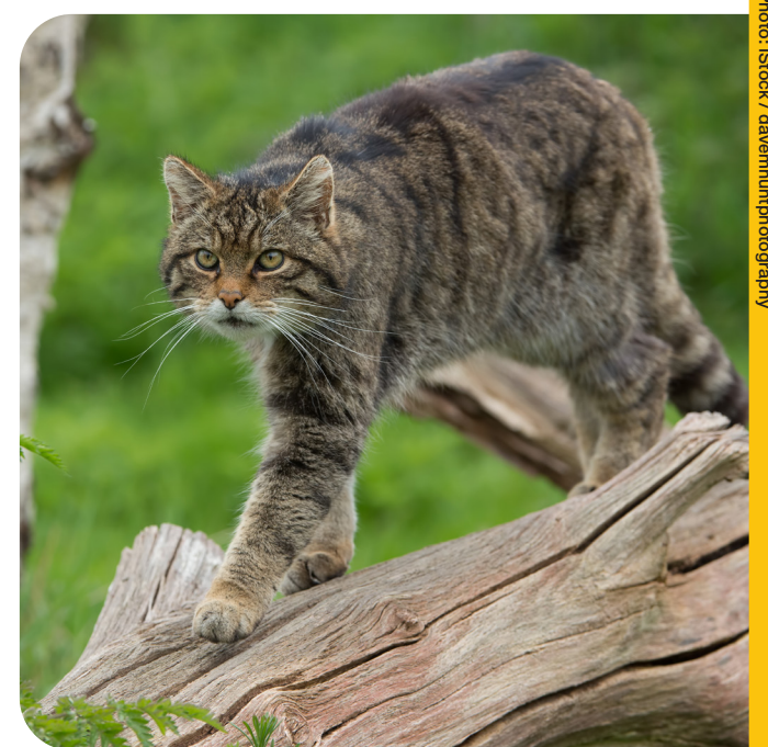
Ancient wild cats probably looked a lot like the Scottish wild cat pictured.

Time for wild cats to shine! Wild cats likely figured out that they could find rodents to hunt if they stuck near these human cities. More humans meant more grain and more mice! Eventually, the cats moved in and made themselves at home!